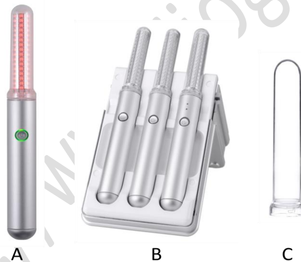
Figure 1: Floreo® LED device (Qlarité SAS. Paris, France) A: Floreo® red LED device. B: Floreo® LEDs platform with 3 devices: blue, red and infrared. C: Floreo® LED protector.

assess the tissue neovascularization. One month post twelve LEDs sessions: the investigators carried out the same basal tests. Adverse events were assessed at all visits. Statistical analysis included appropriate measures for statistical significance (Student's paired two-sample t test) using the standard cutoff for significance of P < 0.05 via Microsoft Excel.