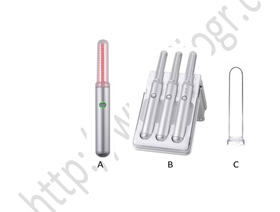
Figure 1: Floreo® LED device (Qlarité SAS. Paris, France) A: Floreo® red LED device. B: Floreo® LEDs platform with 3 devices: blue, red and infrared. C: Floreo® LED protector.

Statistical analysis included appropriate measures for statistical significance (Student's paired two-sample t test) using the standard cutoff for significance of P<0.05via Microsoft Excel.